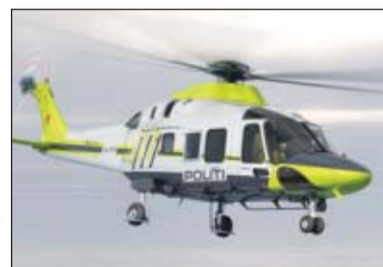
The AW169 is a more capable machine than the police directorate's current EC135 helicopters.

The AW169s will perform a range of tasks including observation, surveillance, special operations team transport and airborne sniping.